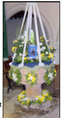
A larger photo can be found on the Home page of the village website.