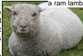
a ram lamb

In the last month we have done various routine health treatments, the lambs have been wormed, and all the flock treated with Blue Tongue vaccine and fly strike spray. Unfortunately one of my new ewes developed mastitis, a painful bacterial infection of the udder. This type of infection usually occurs soon after lambing when the ewe has lots of milk or when the lamb is weaned, in this case the infection was long after lambing and the lamb had not been weaned. After several injections with antibiotics and anti-inflammatories, she is now on the mend but we are doubtful as to whether she will be able to milk on both teats next year.