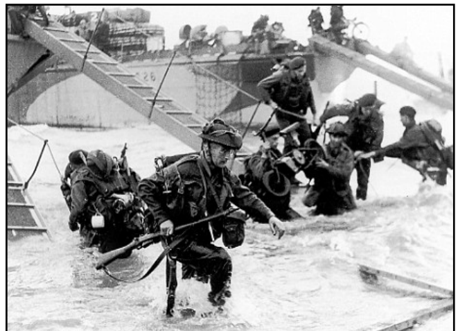
The Normandy Landings