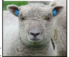
Fetching Blue Tags

While weaning the lambs, I took the opportunity to weigh and worm them. They seem to have grown well, and the biggest ram lamb weighed in at 42Kg (just over 6½ stone in old money). In fact, this fellow has now made his way to our freezer and we had our first new seasons chops last night. Traditionally ram lambs are castrated as male hormones, although helping them grow quicker, can make the flavour too strong for public taste. However I could taste no difference in this 6month old lamb but I remember a fifteen month old ram having a much stronger taste.